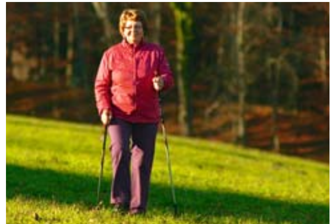
Patients with a history of metal allergy are good candidates for Advanced Surface Technology.