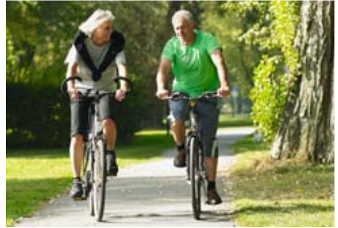
Patients can actively participate in life again.

Biocompatibility and longevity are two of the most important qualities in knee joint replacement. The new coating "AS Advanced Surface" with its excellent wear rate and high metal ion barrier offers both.